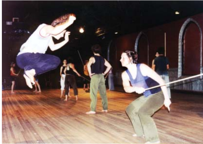
The NACL Performer Training Retreat.